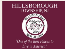
18"x24" Lawn Signs $15