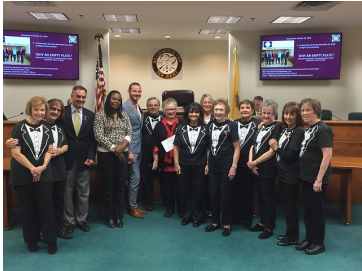
Hillsborough Rockettes & Rocket

The total amount awarded Tuesday evening was $3,594.70. Since the inception of the program, nearly $80,000 in grants to community-based youth, senior and local non-profit organizations have been awarded. The Fall 2018 Grant recipients are: