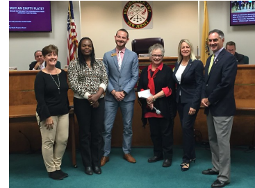
Hillsborough/Millstone Municipal Alliance