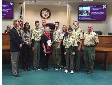
Boy Scout Troop 489