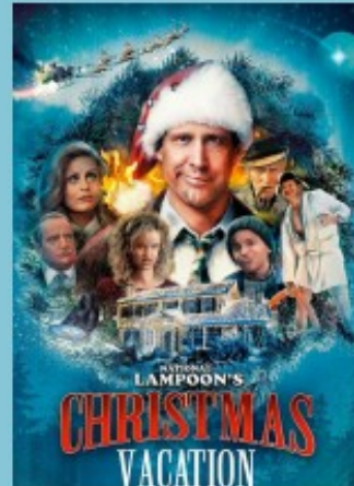
National Lampoon's Christmas Vacation