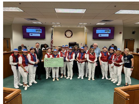
Pictured: The Hillsborough Rockettes and Rocket are awarded a grant by the Hillsborough Credit Cards Rewards Program.

Registration Underway for Scarecrow Festival 2022!