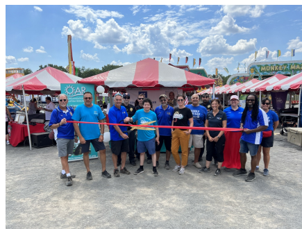
Pictured: Members of the Rotary Club of Hillsborough and OAR join together to cut the ribbon for the Annual Family Fun Day